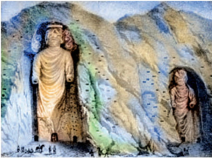
Bamiyan Buddha images

Some images of Hindu gods and goddesses have also been found in Afghanistan. Among them is an image of Ganesha found near the city of Kabul. This image is dated to 4 th century C.E. and it is the earliest image among the extant Ganesha images. It may be noted that even in India an image of Ganesha, as ancient as this one is not found. There is one temple called 'Khair Khana' near Kabul. The excavations at this site have yielded an image of God Surya mounted on a chariot.