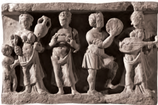
A Sculpture from a stupa at Hadda

The ancient ‘Nagarhar’, modern ‘Hadda’ near Jalalabad in Afghanistan was another important centre of Buddhism. There are several remains of stupas and viharas scattered over the place. The sculptures found around the stupas are excellent specimens of Gandhara style. ‘Takht-i-Bahi’ is another important place, which is enlisted as ‘World Cultural Heritage’. It is in the Pakhtunkhwa province of Gandhara region. It is a part of Pakistan now.