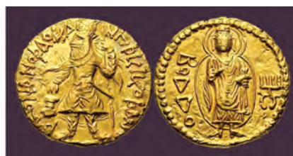
Gold coin of Kanishka

In the Kushana period, Buddhism reached China by this trade route. Some of the coins of emperor Kanishka carry the image of